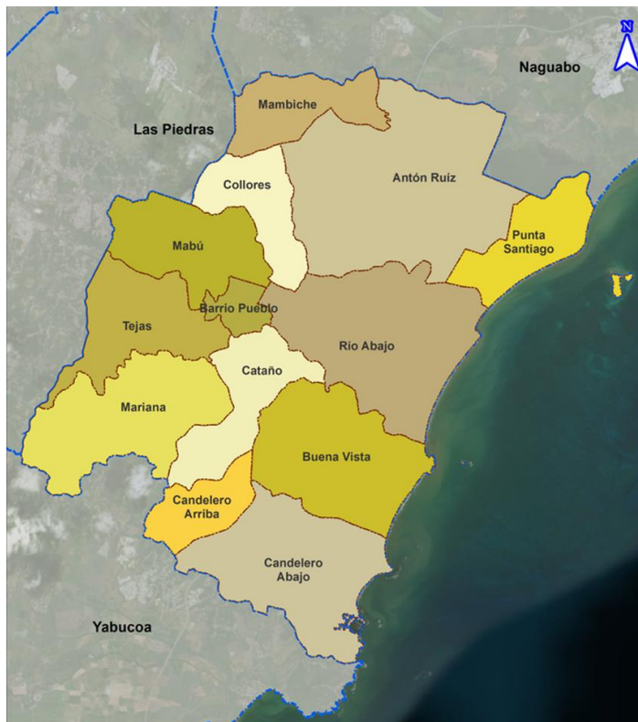
Figure 2: Humacao and its wards

The Municipality of Humacao is located on the eastern coast of Puerto Rico. Its northern border is the Municipality of Naguabo, to the south is the Municipality of Yabucoa, to the west is the Municipality of Las Piedras, and to the east is the Vieques Passage. The Municipality of Humacao has a territorial area of approximately 44.8 square miles (116.1 square kilometers).