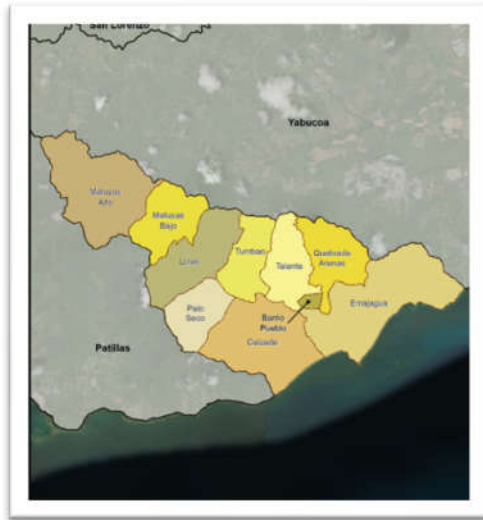
Figure 2: Maunabo and its wards

The municipality of Maunabo is located on the southeast coast, southeast corner of the Island of Puerto Rico. It is bordered by Municipality of Yabucoa by the north and east, with the Mar Caribe by the south, and with the Municipality of Patillas by the west. The territorial extension of the Municipality of Maunabo is approximately 20.7 square miles (53.6 square kilometers).