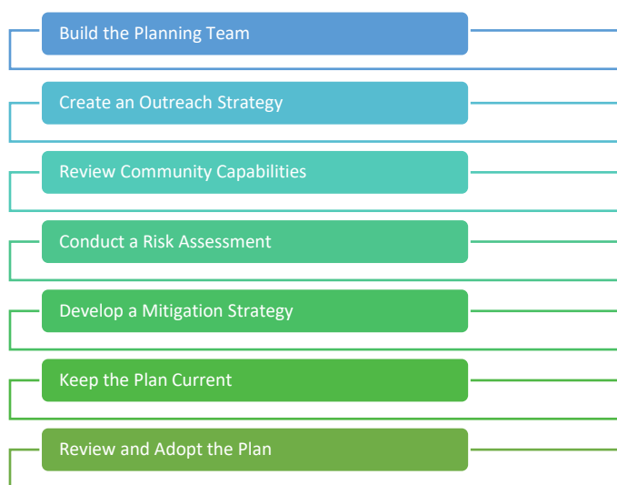
Figure 1 Hazard Mitigation Planning Process

These LHMPs must be revised and updated every five (5) years to remain in compliance with regulations and Federal mitigation grant conditions. This updating requirement offers the municipality an opportunity to reevaluate recommendations, monitor the implementation of mitigation strategies included in the previous Plan, monitor the impact of mitigation actions that have been implemented, and determine if any changes to the Plan need to be incorporated. This Plan complies with said regulations.