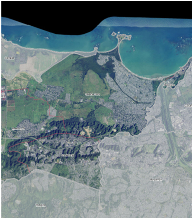
Figure 2: Toa Baja and its wards

The Municipality of Toa Baja is located in the north of Puerto Rico. Its northern border is the Atlantic Ocean, to the west are the municipality of Cataño, to the south is the municipalities of Toa Alta and Bayamón, and to the east is the municipality of Dorado. The territorial extension for Toa Baja is approximately 24.09 square miles (62.4 square kilometers).